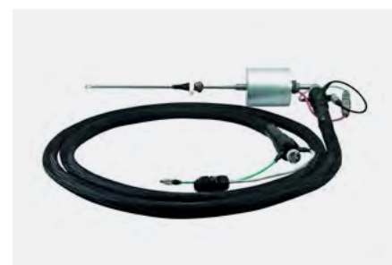
Heated sampling system