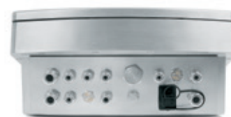
Rear view with cable glands and optional Ethernet connector