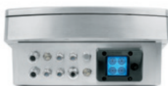
Rear view with cable glands and EzEntry System