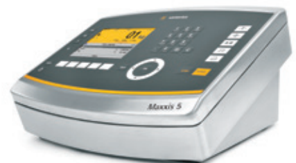
Table top mounting for the Maxxis 5, allowing easy everyday interactions