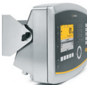
The Maxxis 5 with multi-functionality bracket mounting