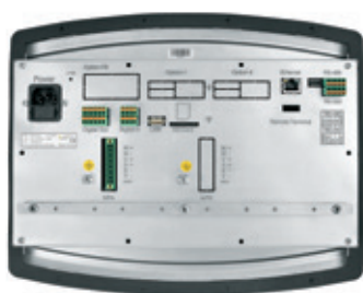
Rear view of a panel mounted Maxxis 5