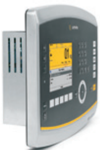
The Maxxis 5, displaying slimline design for panel mounting

With the Maxxis 5, connecting to all other systems has never been easier. All inputs are clearly labeled and easily accessible via the rear of the controller. Simply plug in and define to see immediately all of the benefits a Maxxis 5 controlled system can offer you.