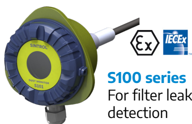
S100 series For filter leak detection