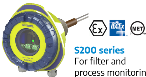
S200 series For filter and process monitoring