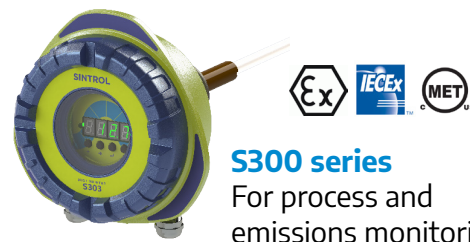
S300 series For process and emissions monitoring