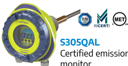
S305QAL Certified emissions monitor