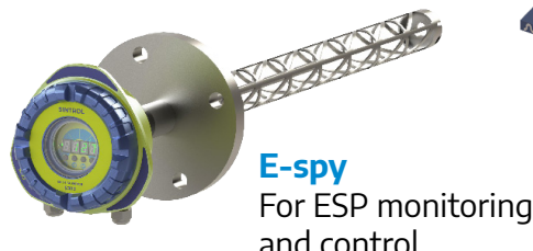
E-spy For ESP monitoring and control