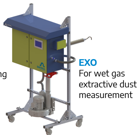
EXO For wet gas extractive dust measurement